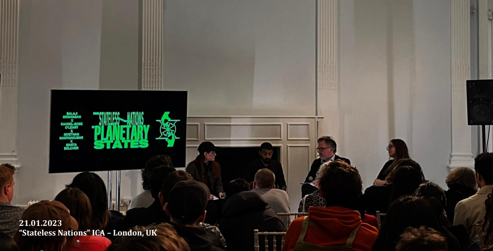
21.01.2023 "Stateless Nations" ICA - London, UK