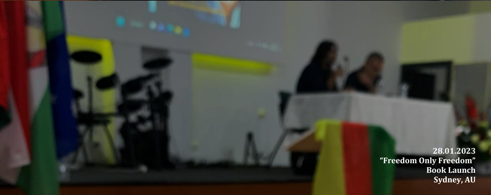
28.01.2023 "Freedom Only Freedom" Book Launch Sydney, AU