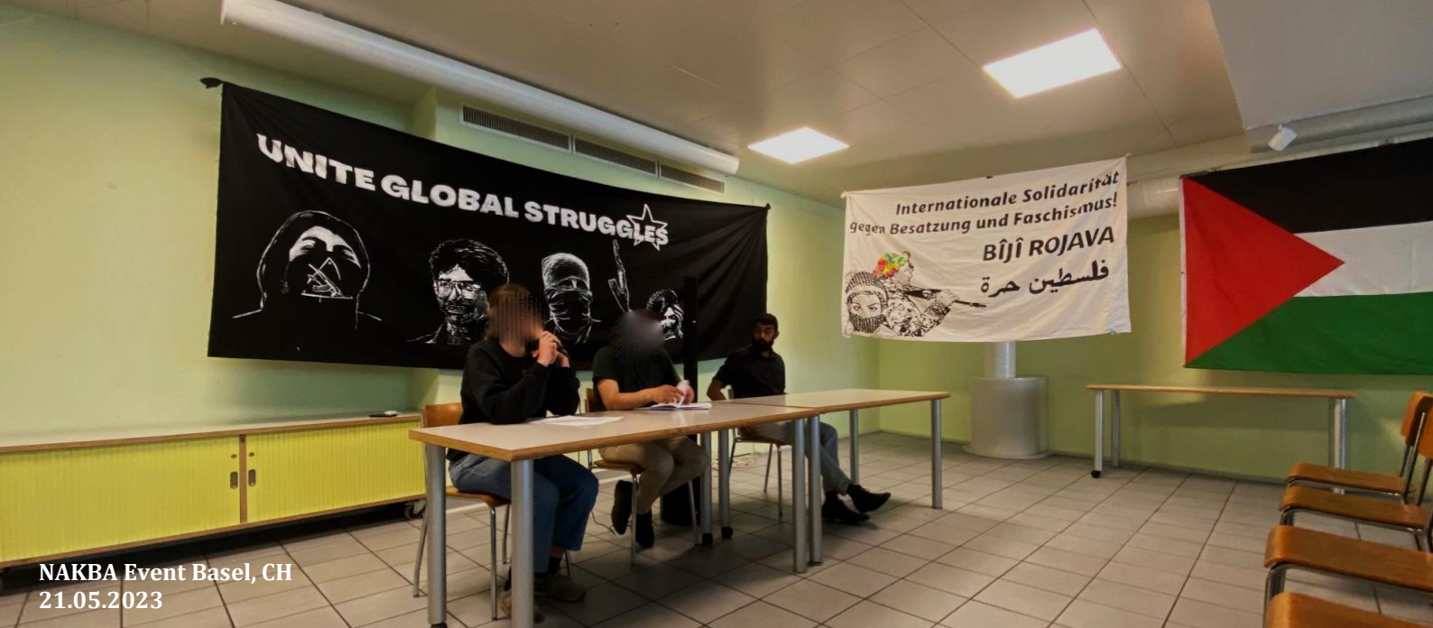
NAKBA Event Basel, CH 21.05.2023