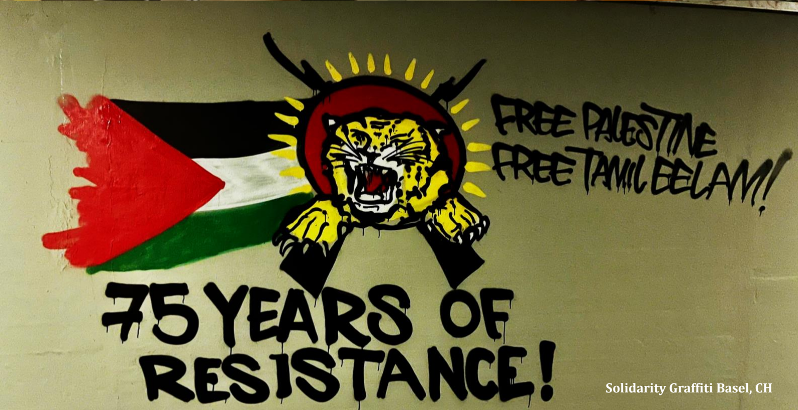
Solidarity Graffiti Basel, CH