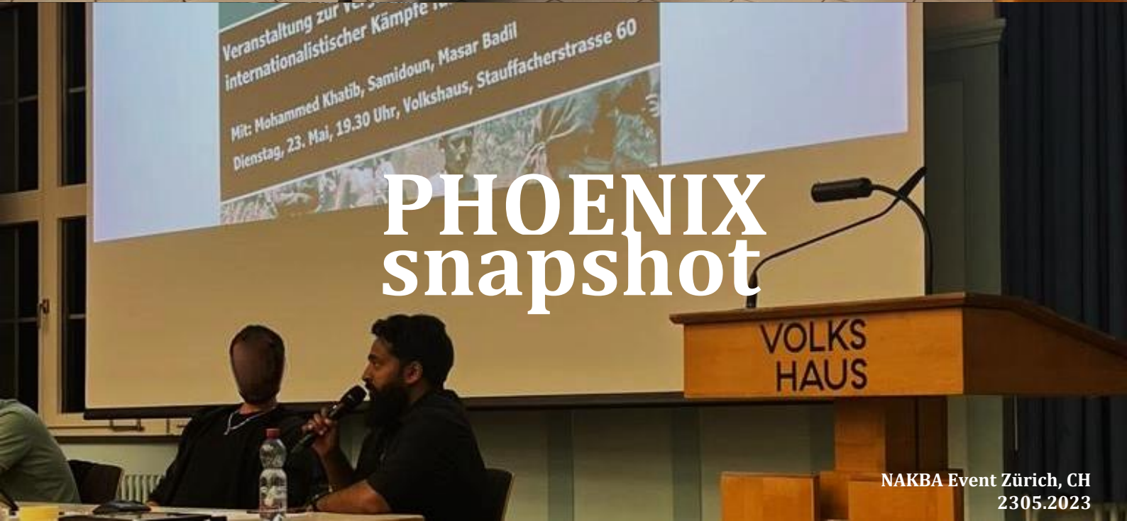
NAKBA Event Zürich, CH 23.05.2023