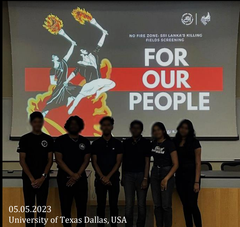
05.05.2023 University of Texas Dallas, USA

Our aim is to educate the Tamil youth as well as other communities and thus interconnect us internationally through global resistance networks.