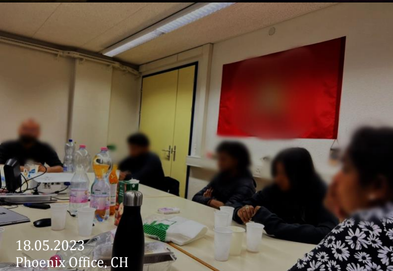
18.05.2023 Phoenix Office, CH