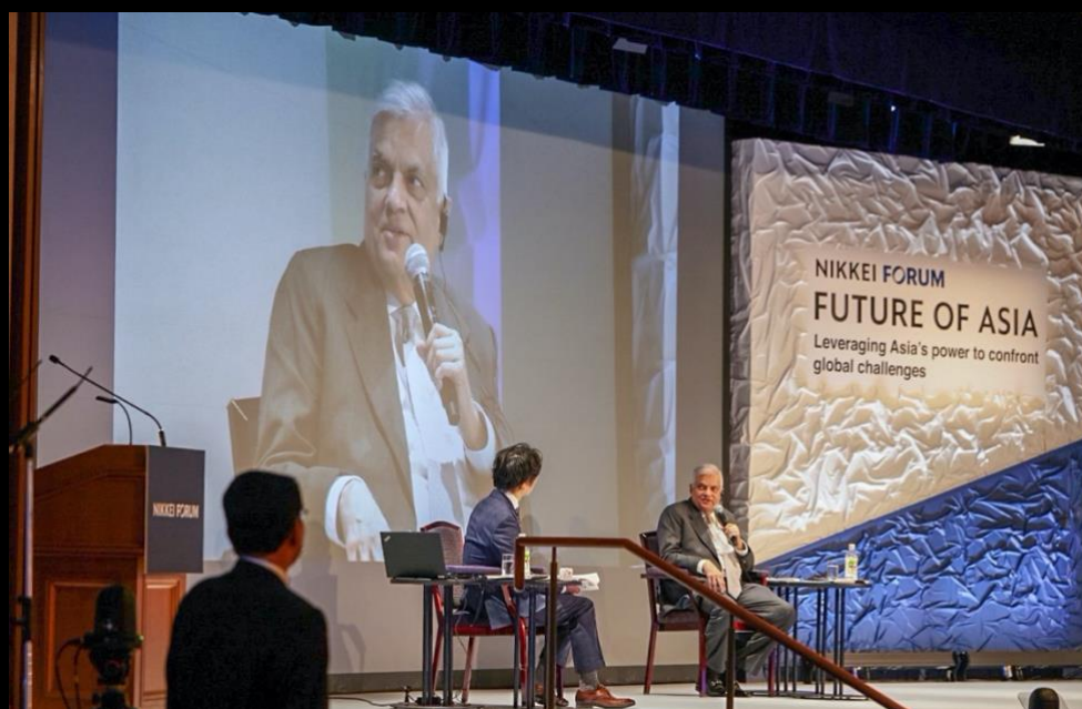
R. Wickremesinghe Nikkei Forum Address "Future of Asia"

Law. As the law stands now, SL's President is not required to declare his assets, and if the bill is passed and enacted into law, their President will have to join members of SL's Parliament and other high-ranking judicial and public sector officials to declare their assets and liabilities annually.