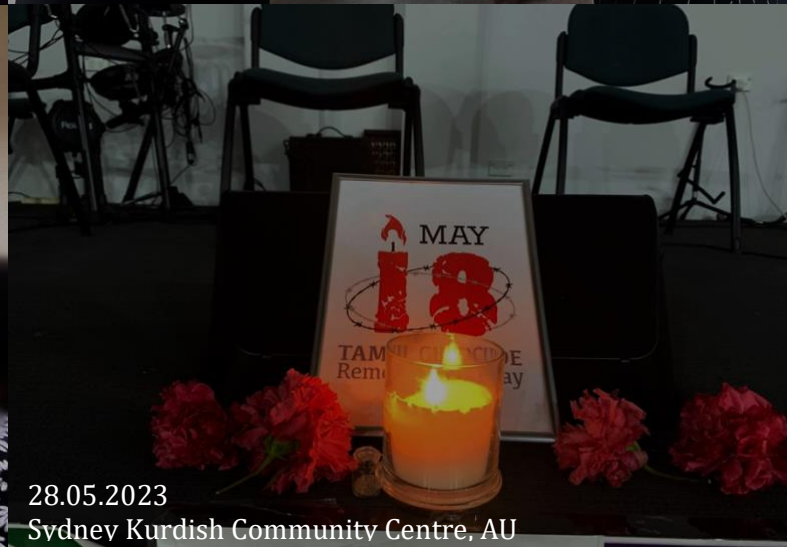
28.05.2023 Sydney Kurdish Community Centre, AU