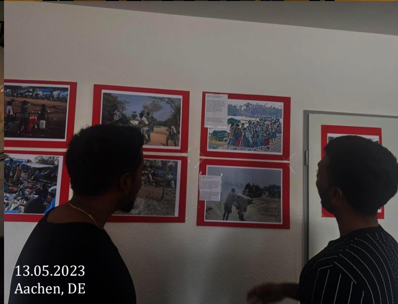
13.05.2023 Aachen, DE