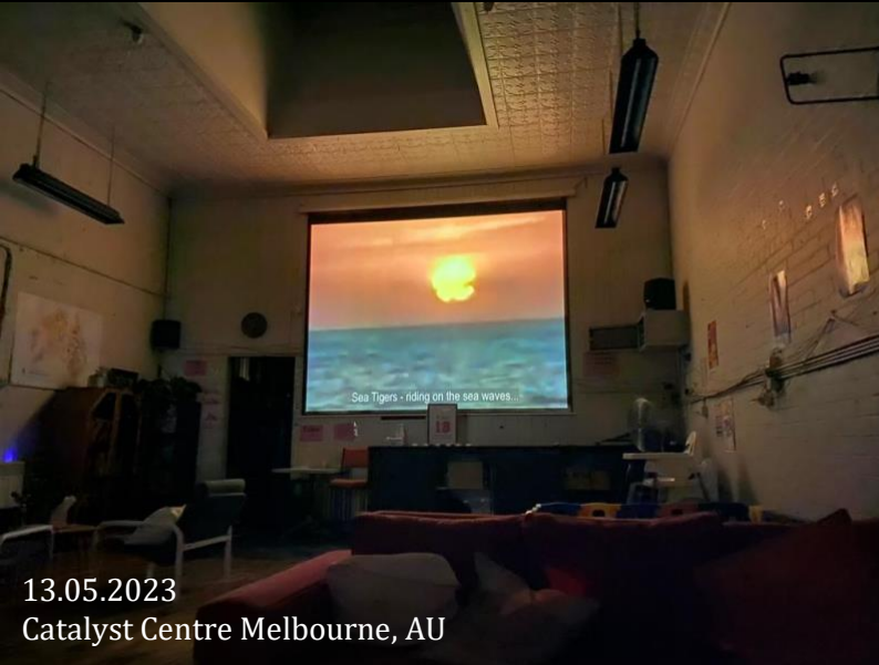
13.05.2023 Catalyst Centre Melbourne, AU