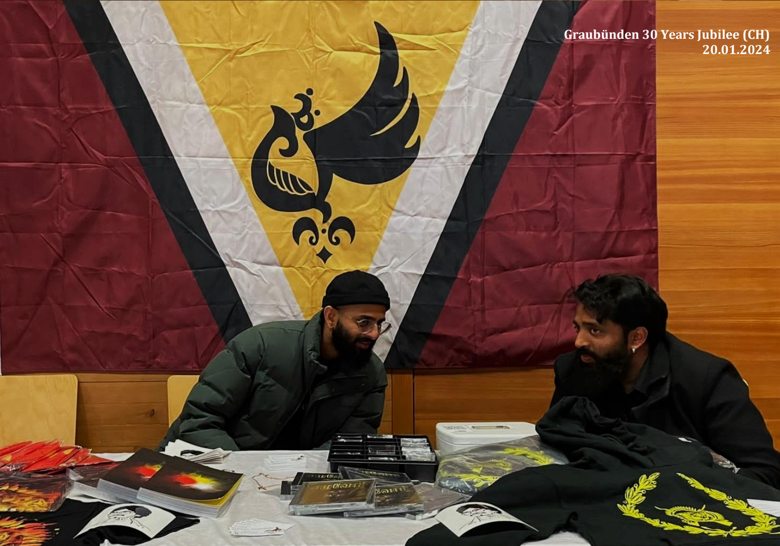
Graubünden 30 Years Jubilee (CH) 20.01.2024