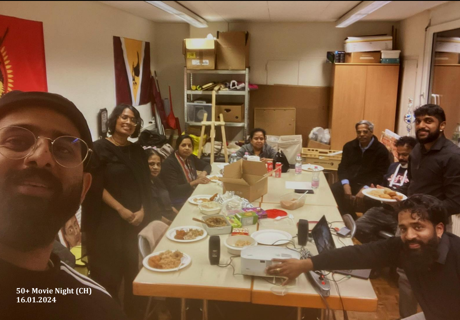
50+ Movie Night (CH) 16.01.2024