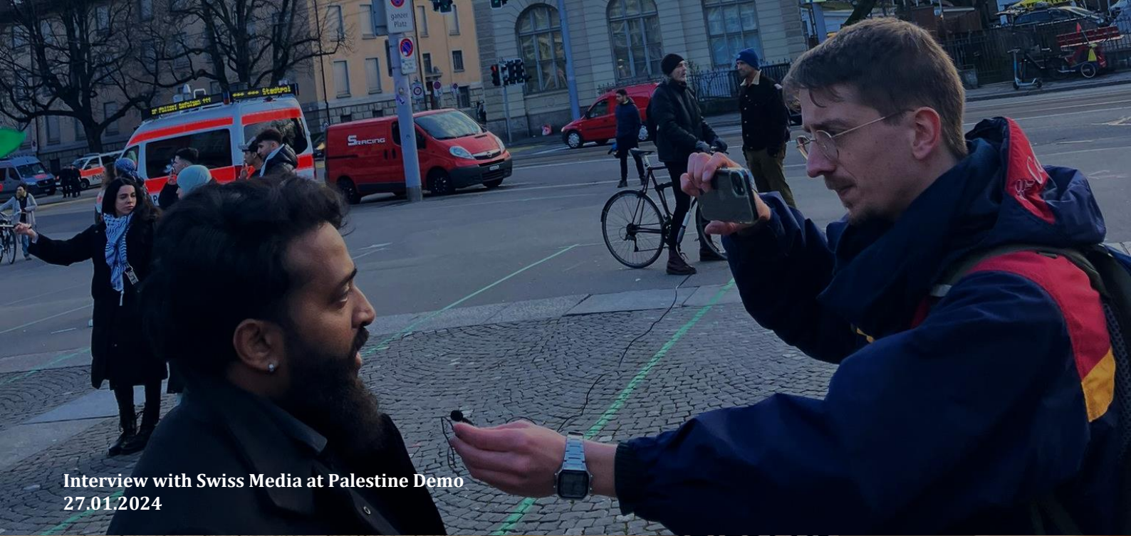
Interview with Swiss Media at Palestine Demo 27.01.2024