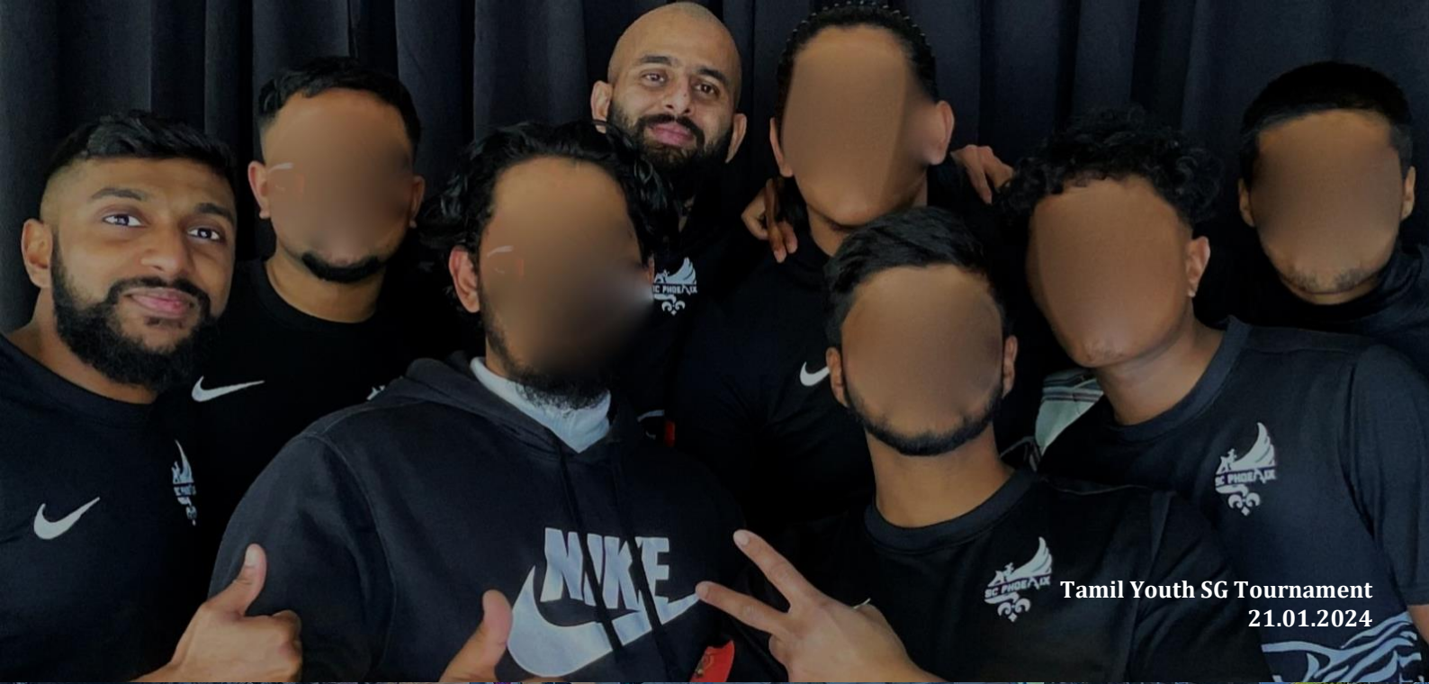
Tamil Youth SG Tournament 21.01.2024