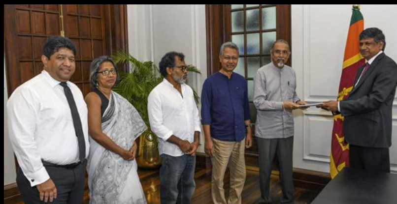
Unnamed Bill Drafted