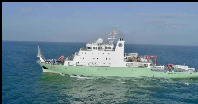
Research Vessels