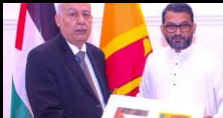
Tea Donation to Palestine

31.01.2024: India - According to Economy Next, an Indian company is to be appointed to manage SL's 03 airports, including the main Bandaranaike International Airport (BIA), where SL is now experiencing an oversaturation of foreign tourists. SL is expecting 2.2 million tourists to arrive in 2024. However, the main airport is required to improve its capacity to cope with these numbers.