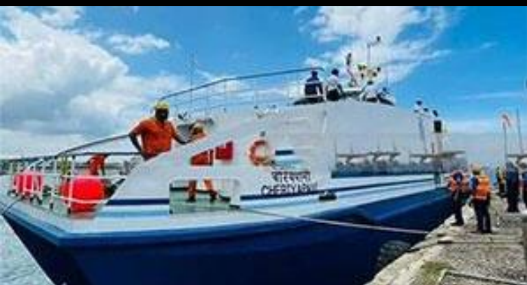
KKS Ferry Service

31.01.2024: Laws - According to Economy Next, the Speaker of SL's Parliament Mahinda Yapa Abeywardana has approved the Certificate of Recognition and Enforcement of International Settlement Agreements Resulting from Mediation and the Notaries (Amendment) Bill . The 02 bills were recently passed in SL Parliament.