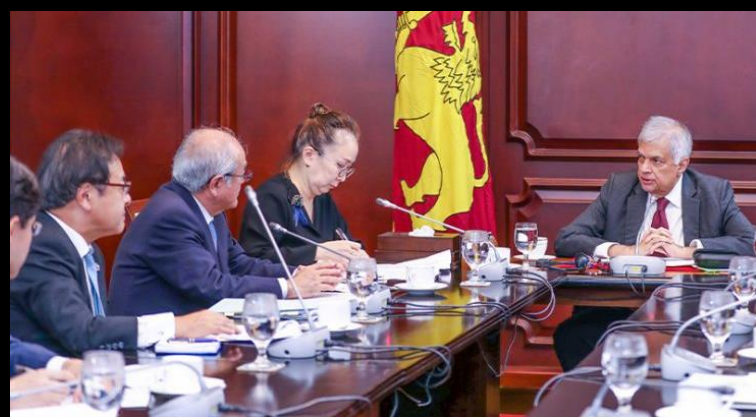
Japanese Delegation Meeting