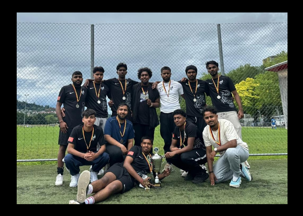
02.07.24: Switzerland , Maveerar Cup, runner up