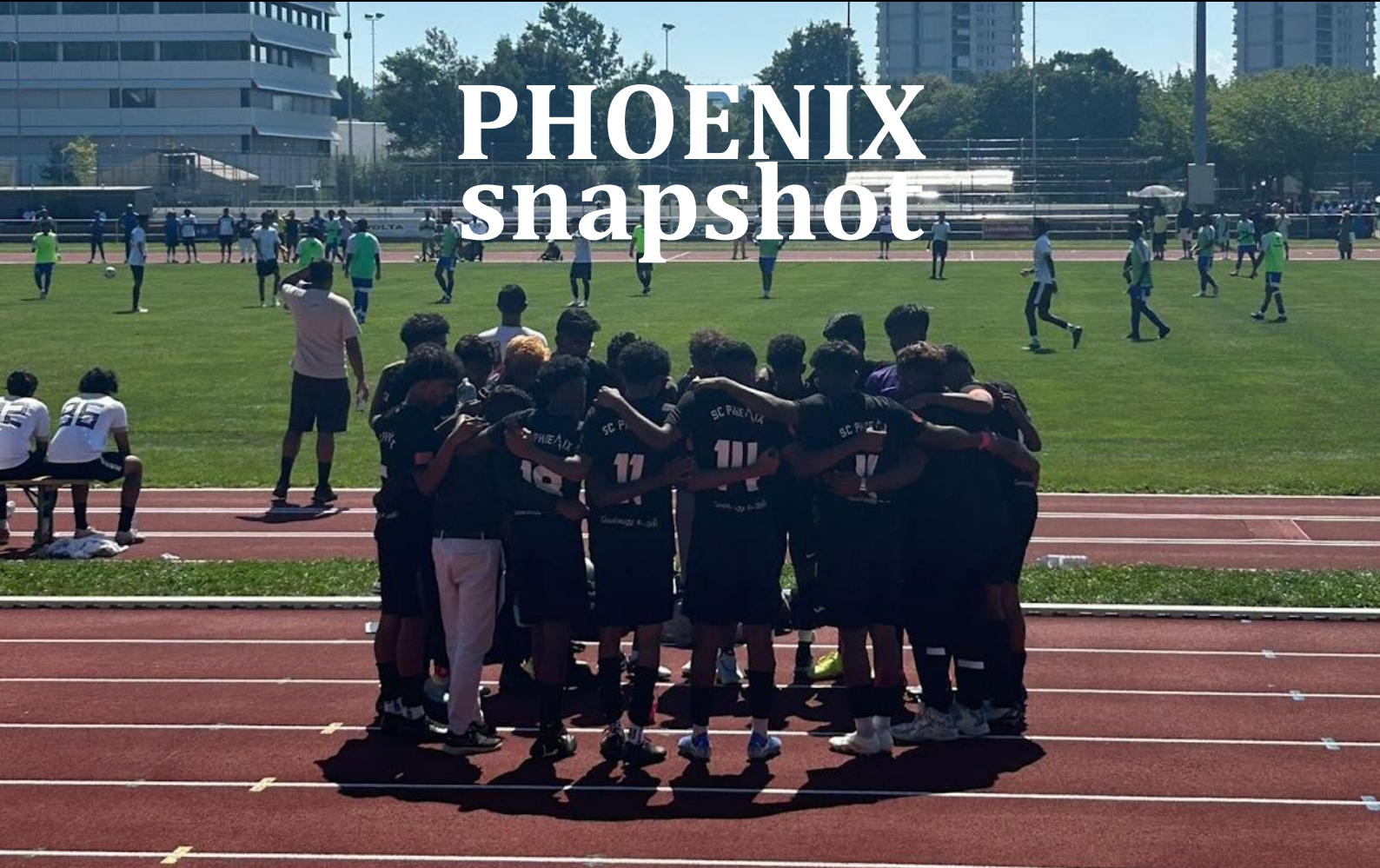
11.08.2024: SC Phoenix at Tamar Cup in Winterthur, Switzerland.