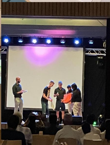
24.08.2024: Phoenix 10 th anniversary event, Switzerland.