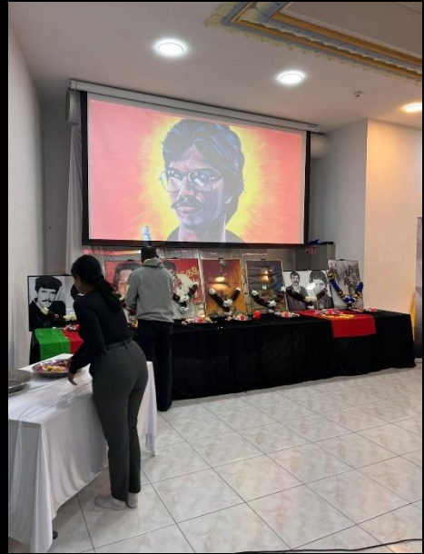
26.09.2024 HFT, Switzerland