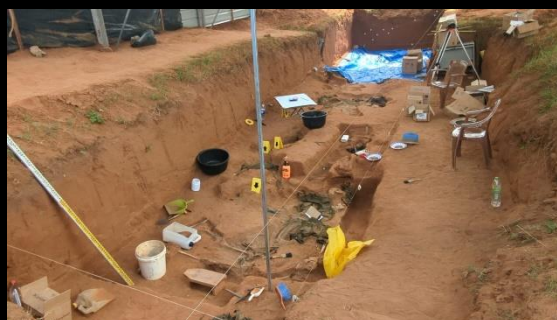
Kokkuthoduvai

20.09.2024: Mannar - According to Economy Next, the state-owned Sri Lanka Ports Authority (SLPA) has launched a tender to develop the Talaimannar North Pier at the Port of Mannar on a Build, Operate, Transfer (BOT) basis. This development is in parallel with the Indian Adani Group's plans to set up 02 wind power projects in the Mannar region. The Port of Mannar will mainly serve as a regional port for passenger and cargo activities. Since November 2023, the port has been under the SL Ports Authority Act to support a new ferry link between Mannar and India. Expressions of Interest (EOIs) can be submitted until 30.10.2024.