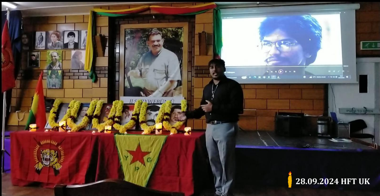
28.09.2024 HFT UK