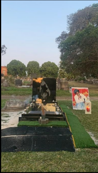
26.09.2024 HFT vigil, Australia.